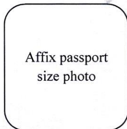
Photo graphs of the scribe